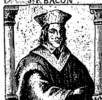
Scholar of Cambridge